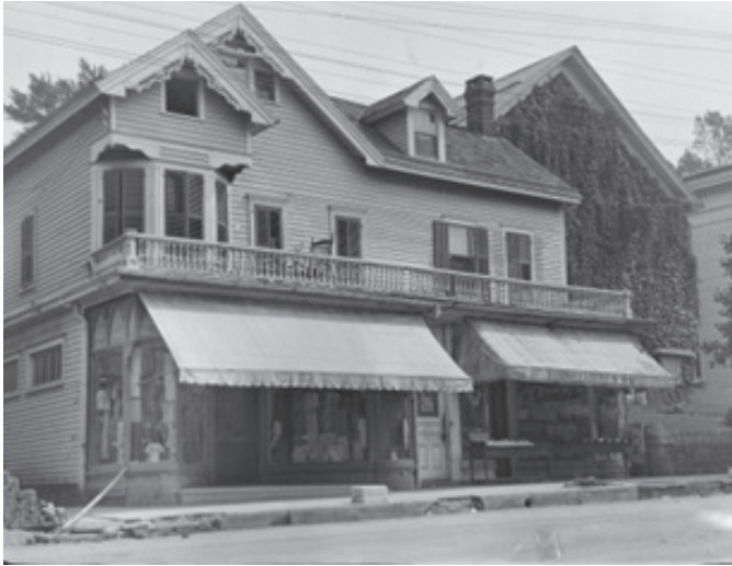
Keeler Store Baptist Church Sunday School in ivy.

there was also a bakery. The second and third floors were offices and apartments. In the rear were the bakery's oven building, garages, and two dwellings, serviced by Lake Court as shown on the map. Over the years, many young boys would visit the bakery and get dough balls from the owner to use on their fishing rods as bait. During ice skating season, there was always hot chocolate for sale.