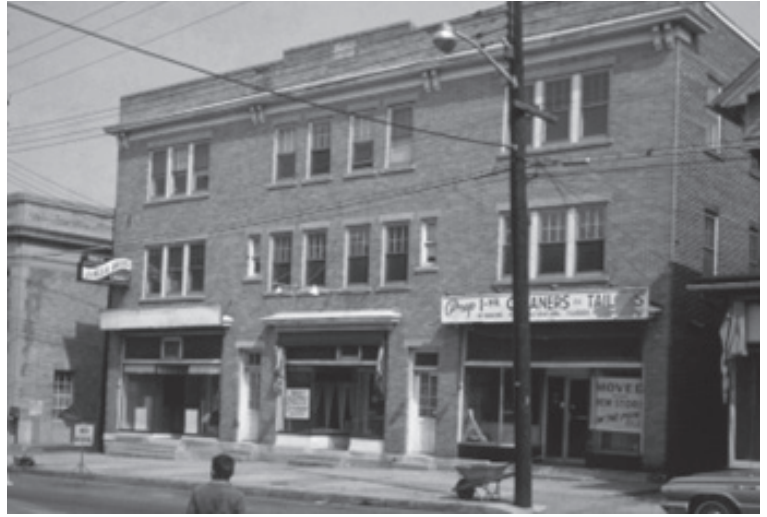
Razed for the bank's drive-thru and parking lot.