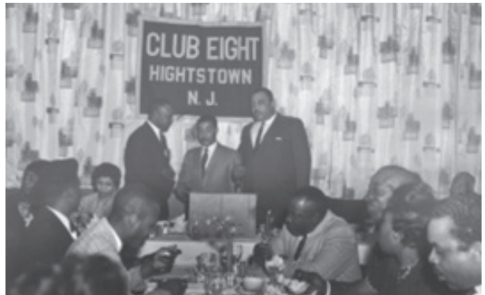
Please contact me by email if you recognize anyone else in the photos.