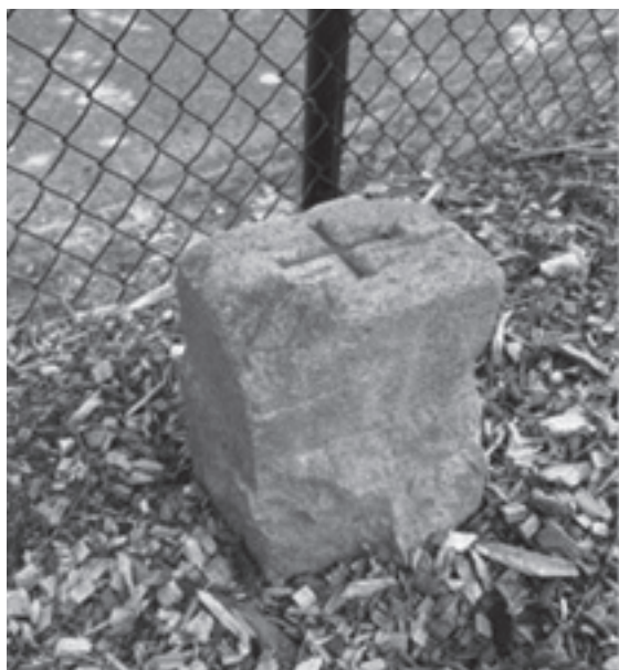
In situ Post Office.

So, this little marker, one of hundreds along the UT and C&A railroad, is definitely a property line marker. For those following current events