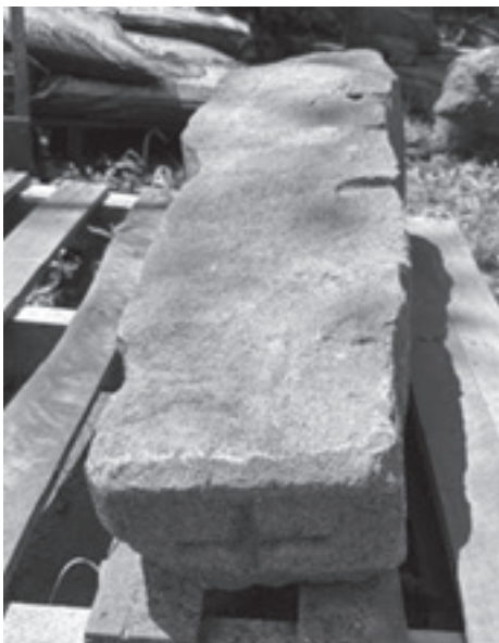
On a pallet.

ranged for him to visit Village Nurseries to inspect the stone. When we met, he advised that it was the same kind of marker that he had located in the borough along the greenway park off Morrison Avenue. About 50 feet from the “W” whistle post. This was the old Camden & Amboy railroad bed, and he walked the same and found identical markers every quarter of a mile. There is another one behind the current post office, adjacent to the Housing Authority parking lot. After he inspected the stone, he advised that it was Stockton