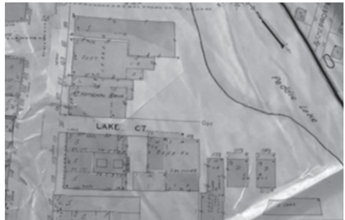
1925 Sandborn map showing Lake Court and rear buildings.