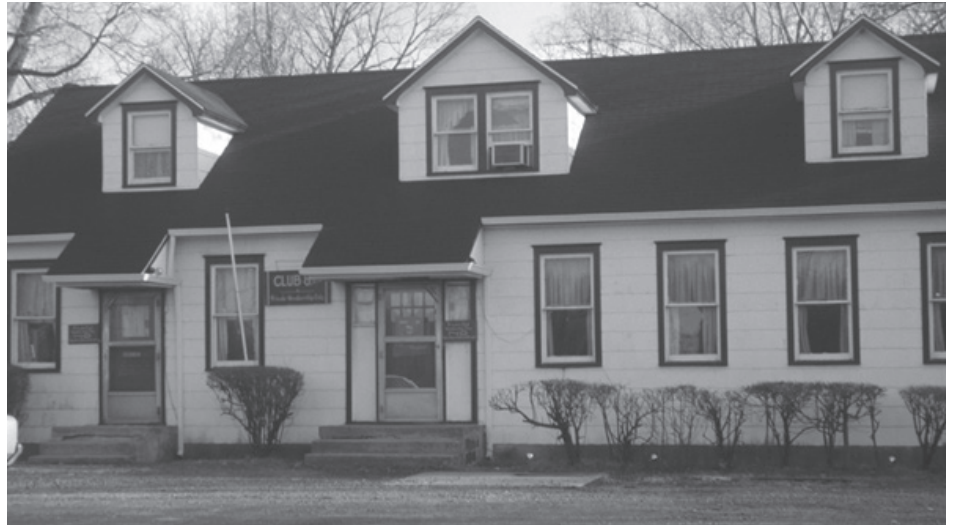
Club 8 while still operating