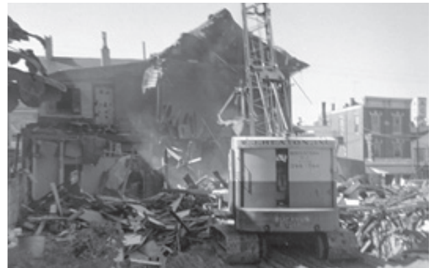
Razing buildings in the 1960s for the drive-thru.