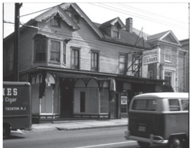
Razed for drive-thru entrance from Main Street.

Fires have changed the appearance of our downtown many times since the mid-1800s. However, sometimes the appearance was changed not by fire, but by intentional razing and replacing. This is not just in the past, but also what will be in our