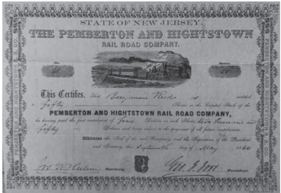
The Union Transportation Company, originally the Pemberton and Hightstown Rail Road Company was investor owned. This is an copy of 50 share stock certificate 1864.