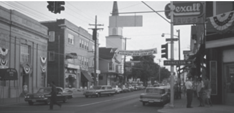
Looking south include building that replaced Smith building.