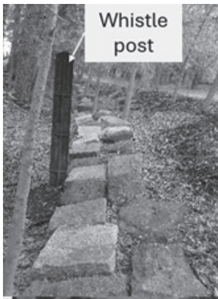
Another at Greenway Park.