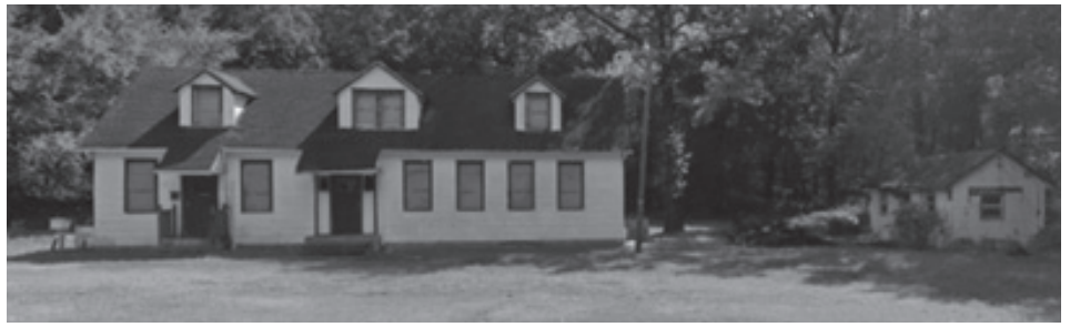
651 Mercer Street - Prior to the razing.

women who ran tourist homes because their husbands could not get jobs that paid well enough to support their families, the men who saw opportunity and opened motels based on the amount of traffic passing through their towns, and the businessman who financed those who offered beauty, entertainment, and style to middle class African Americans. These unsung people were the backbone of the African American tourist industry. ( https://community.village.virginia.edu/greenbooks/content/pauls-inn ).