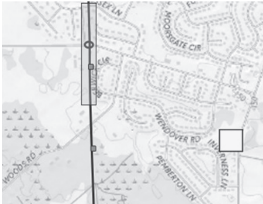
Presumed original location at Village Nurseries (Square).

ranged for him to visit Village Nurseries to inspect the stone. When we met, he advised that it was the same kind of marker that he had located in the borough along the greenway park off Morrison Avenue. About 50 feet from the “W” whistle post. This was the old Camden & Amboy railroad bed, and he walked the same and found identical markers every quarter of a mile. There is another one behind the current post office, adjacent to the Housing Authority parking lot. After he inspected the stone, he advised that it was Stockton