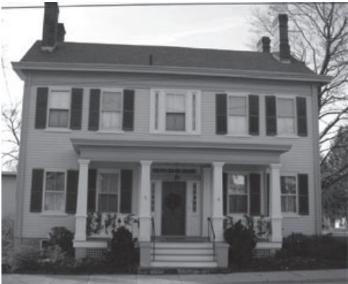
The House is open to tour the first Sunday of each month from 1 - 3 pm.